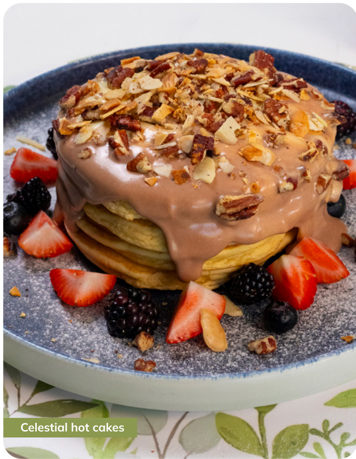
Celestial hot cakes