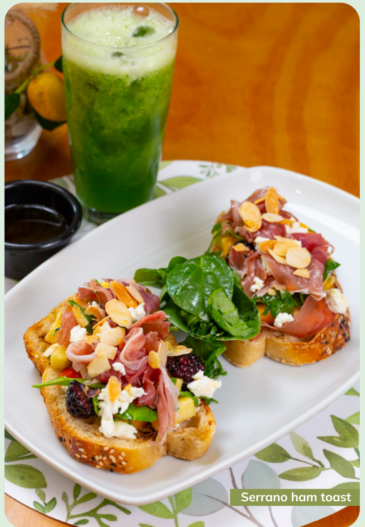
Serrano ham toast