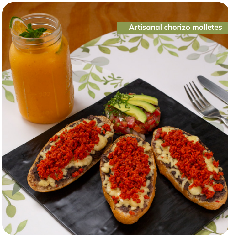
Artisanal chorizo molletes