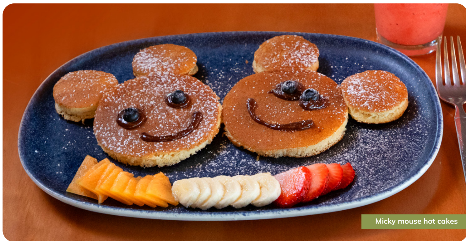
Micky mouse hot cakes