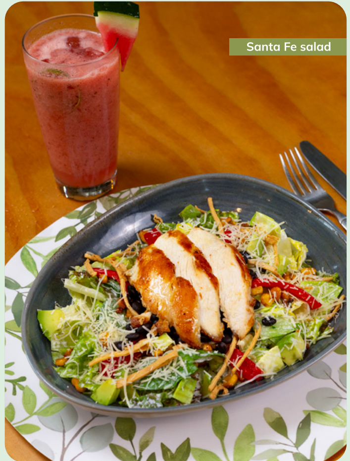
Santa Fe salad