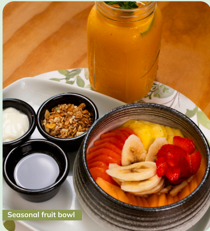
Seasonal fruit bowl

Made from natural rolled oats cooked in coconut milk until creamy and smooth. Served with Tabasco banana, honey, strawberry, and blueberry.