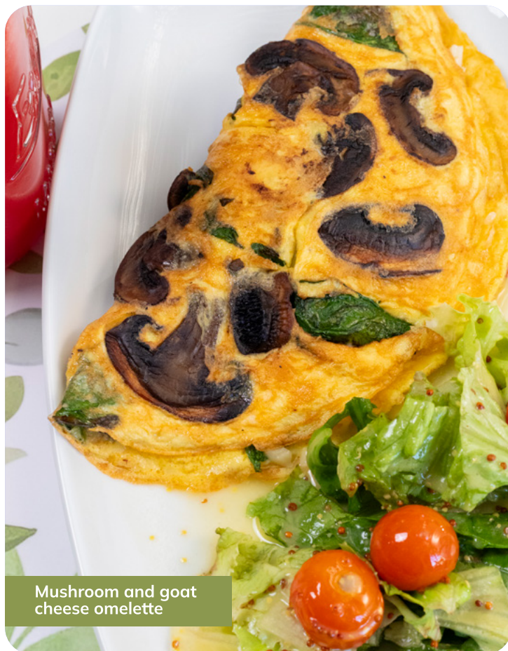
Mushroom and goat cheese omelette